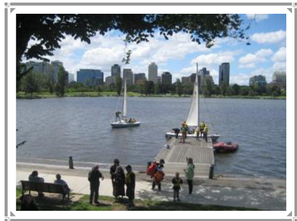
Picturesque Albert Park Lake