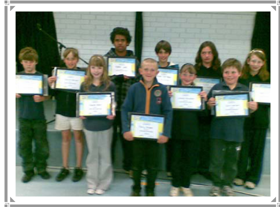
2010 Term 4 Murray Bridge North School