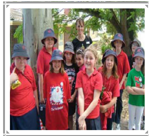
The K-Kids visited the BUPA Nursing Home prior to Christmas, where they performed a Christmas concert.