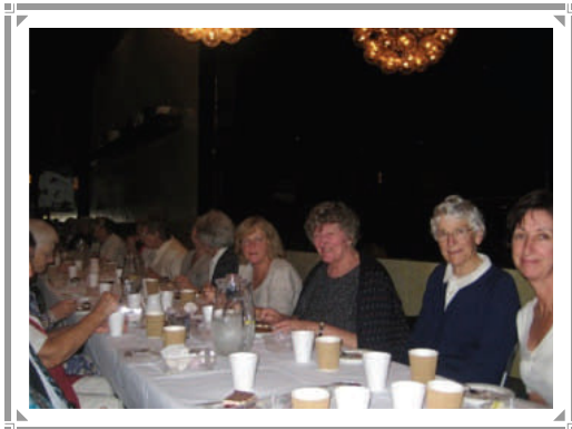
Some of the many supporters on the night.

Popular social "Charity Do." fundraiser raised a total of $500, the best one so far from all the film-luncheons I have hosted in Brighton these past three years. This recent rise of support for our Club's worthy causes, and especially this one benefiting QLD Floods Victims, was clearly demonstrated by the regulars who spread the word about it and invited their friends along. Local Businesses, mainly restaurants, sponsor these fundraisers by donating meal vouchers which I raffle for free as Door Prizes. These promote not only their business but also Kiwanis and our Club. They are also much appreciated by all our guests.